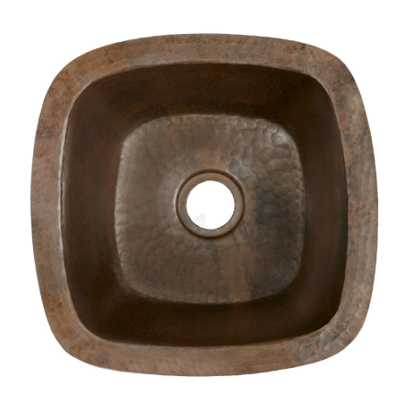
CPS247- Antique CPS547- Brushed Nickel