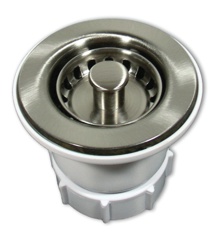
DR220-BN Brushed Nickel DR220-CH Chrome DR220-ORB Oil Rubbed Bronze DR220-PN Polished Nickel DR220-SC Solid Copper DR220-WC Weathered Copper