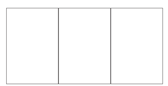
Ganging Cabinet-to-Cabinet Arrangement